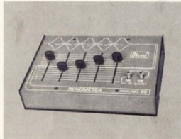
RENOMETER NO. 95 It is the latest in musical instrument equalization and has the capacity to cut and boost frequencies in the response range of most selective guitar pickups.