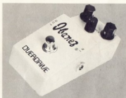
OVERDRIVE OD-850 Clean distortion and infinite sustain for that thick. Play full chords without the harmonic break-up of other fuzz tones.