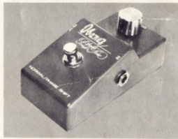
MINI-PHASE NO. PT-999 The PT-999 is an electronic phase shifter which simulates the sound of rotating speakers, or the Doppler Effect.