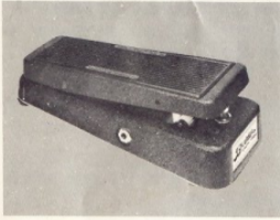
BLUBBER NO. 93 "CRY and Wau-Wau" sound made popular by today's modern ROCK music