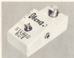
STEREO BOX NO. ST-800 It provides an automatic variable speed pan between two amplifiers for a dramatic stage effect.